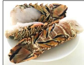
Enjoy mouth watering food – incredible settings