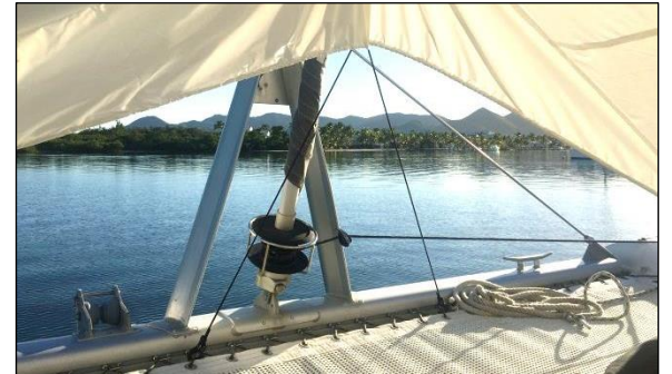
Experience marine life up close in natural settings