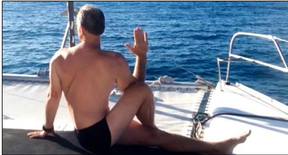
Breathe and live immersed in the "Art of Nature"