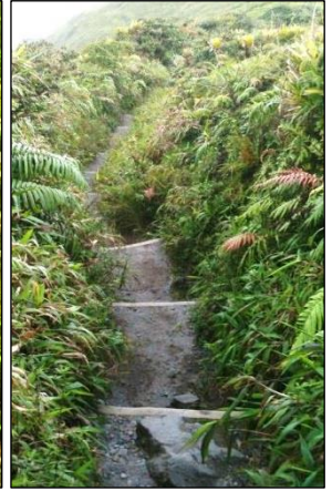
Relax on the tramp in the shade with a book, or sleep under the stars, an evening you will treasure.